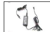
Model ZN9-ACP02-[ ][ ]

The AC adapter is not same the accessory with ZN-PD[ ][ ]-S[ ] as Model ZN9-ACP02-[ ][ ]. ZN9-ACP02 adjusts added some technical standard and changes contents of label, but the main unit of ZN-PD-S can be used with each AC adapter.