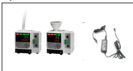
Model ZN-PD[ ][ ]-S[ ]

You can order ZN-PD[ ][ ]-SA (not include AC adapter) and ZN9-ACP02-[ ][ ] (only AC adapter), and you can use them as well as these sets.