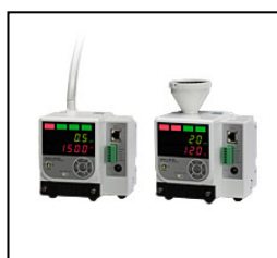
Model ZN-PD[ ][ ]-SA